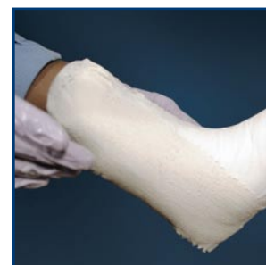
Ortho-Flex®'s unique gauze enables clinician to cast around difficult angles without tucking or folding.